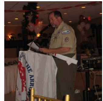
The Supreme Chief of the fire gives keynote address at the Winter Banquet.