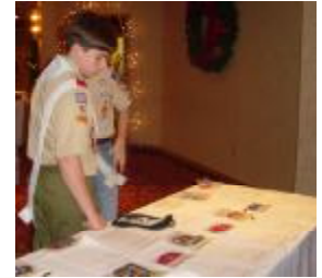
The patch auction at the Winter Banquet