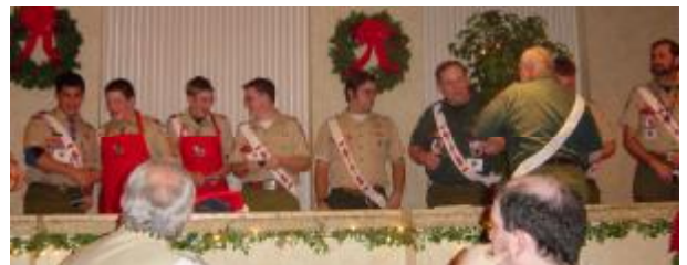
Presentation of the Arrowman Service Award