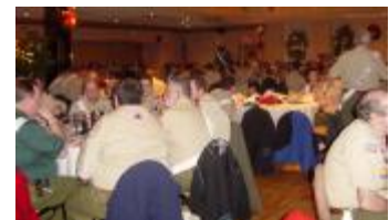
Over 130 brothers enjoyed food and fun