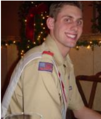
Having a great time!